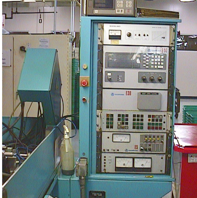
Original Marposh E14 control

Sauer-Danfoss selected the MACHINEMATE ® CNC systems for these retrofits. MACHINEMATE , INC. (of Fond du Lac, WI) is a manufacturer of PC Based CNC systems. The MACHINEMATE control has an Open PC-based architecture so Sauer-Danfoss could access and change the machine's configuration if needed. The CNC comes in a CE rated stainless steel industrial enclosure with a sealed IP65 flat panel color TFT display. Sauer-Danfoss elected to replace the existing motors and drives with a new MACHINEMATE digital SERCOS drive system connected to the MACHINEMATE CNC via fiber optics. According to Larry, "The MACHINEMATE has the look and feel of a real machine controller. This was more familiar to our people than a Desktop PC running controller software. When the MACHINEMATE CNC was first shown to me I was impressed by how easily I was able to navigate the Operator Interface, CNC Set-up and Maintenance screens. Logical CNC operation aids the initial learning curve and becomes important again when you suddenly need to work on a machine that has been trouble free for several years".